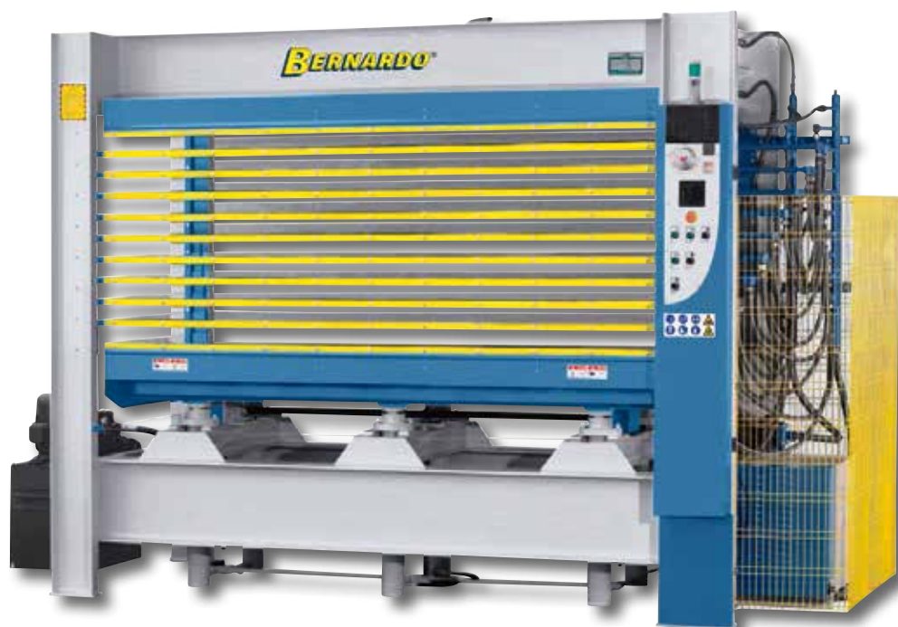
Picture showing HFPS 100 model with 10 levels