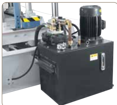
Piston stroke features oversize hydraulic unit and pump with 2 settings for continuous operation