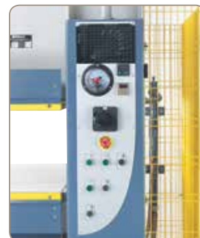
All settings and adjustments on machine front (HFP Model)