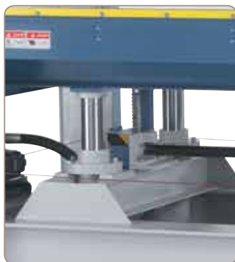
Parallel guided gear racks guarantee continuity of press plate