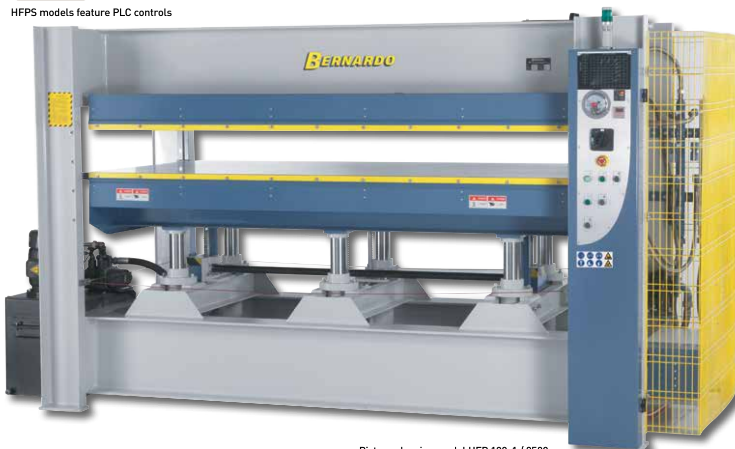
Picture showing model HFP 100-1 / 2500