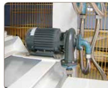
Oil pump for thermo oil

HFPS models feature Siemens PLC controls