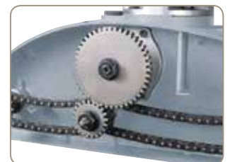
Rearrangement of gear wheels allows for easy speed change.