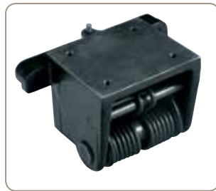
Ideal for spindle moulders for convenient feed disengagement. (optional extra)