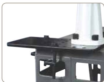
Optional assembly plate QH-01 to allow for quick and easy attachment (Baby M3 / AF 32)